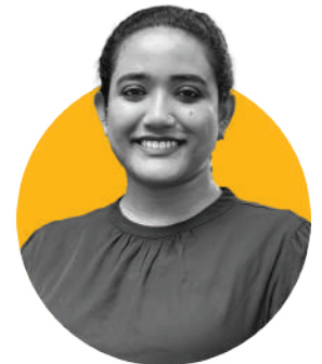
Shabna K Zero Studio, India