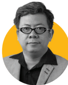
Vinh Phuc Ta ROOM+ Design & Build, Vietnam